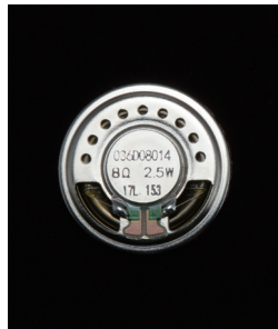
Icom custom high power handling capacity speaker