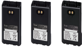
BP-278 BP-279 BP-280

BP-278: 1190 mAh (typ.), 1130 mAh (min.) rechargeable Li-ion battery. BP-279: 1570 mAh (typ.), 1485 mAh (min.) rechargeable Li-ion battery. BP-280: 2400 mAh (typ.), 2280 mAh (min.) rechargeable Li-ion battery.