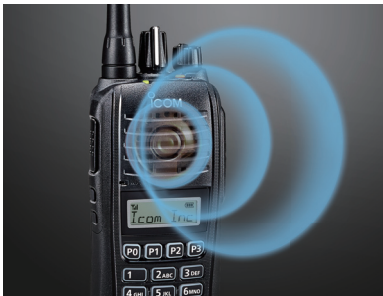
1500 mW powerful audio