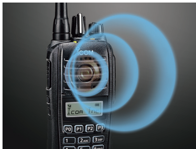
1500 mW powerful audio