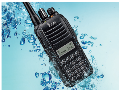
Waterproof for 30 minutes in one meter depth of water