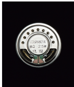
Icom custom high power handling capacity speaker