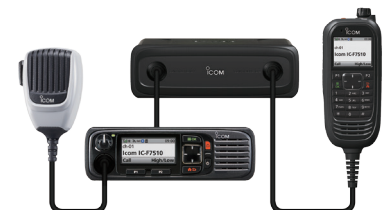
COMMANDMIC™ and Detached Controller Optional RMK-5, COMMANDMIC, HM-218 and separation cables required.

Icom, Icom Inc. and the Icom logo are registered trademarks of Icom Incorporated (Japan) in Japan, the United States, the United Kingdom, Germany, France, Spain, Russia, Australia, New Zealand and/or other countries. COMMANDMIC is a trademark of Icom Incorporated. The Bluetooth® word mark and logos are registered trademarks owned by Bluetooth SIG, Inc. and any use of such marks by Icom Inc. is under license. AMBE+2 is a trademark and property of Digital Voice Systems, Inc. 3M, Peltor, and WS are trademarks of 3M Company. All other trademarks are the properties of their respective holders.