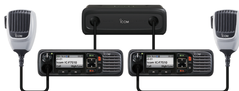
Dual Head Controller Optional RMK-7, hand microphone and separation cables required.