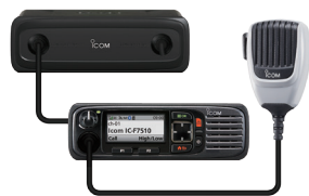
Detached Controller Optional RMK-5 and separation cable required.

Some options may not be available in some countries. Please ask your dealer for details.