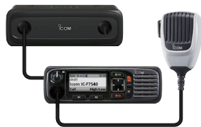
Detached Controller Optional RMK-5 and separation cable required.