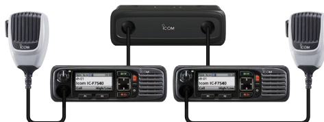
Dual Head Controller Optional RMK-7, hand microphone and separation cables required.