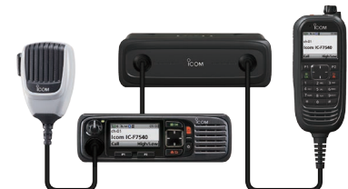
COMMANDMIC™ and Detached Controller Optional RMK-5, COMMANDMIC, HM-218 and separation cables required.

Icom, Icom Inc. and the Icom logo are registered trademarks of Icom Incorporated (Japan) in Japan, the United States, the United Kingdom, Germany, France, Spain, Russia, Australia, New Zealand and/or other countries. COMMANDMIC is a trademark of Icom Incorporated. The Bluetooth® word mark and logos are registered trademarks owned by Bluetooth SIG, Inc. and any use of such marks by Icom Inc. is under license. AMBE+2 is a trademark and property of Digital Voice Systems, Inc. 3M, Peltor, and WS are trademarks of 3M Company. All other trademarks are the properties of their respective holders.